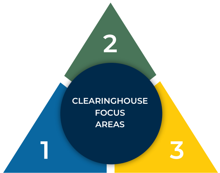
Figure 1: Clearinghouse Focus Areas

The Clearinghouse consists of three integrated focus areas: the mission compatibility evaluation process; the active development of technical solutions; and stakeholder engagement with state, federal, and tribal governments (see Figure 1). Communication, early and often, is critical in ensuring the timely resolution of concerns that support both energy generation and transmission needs.